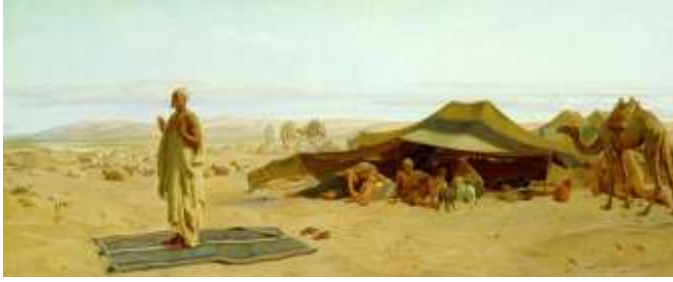
(Artist: Frederick Goodall Date: 1872)

Remember! O people of faith! Remember the day of reckoning. Remember the day of your compensation. Remember the day of your redemption. Remember the day when no outside help shall reach your