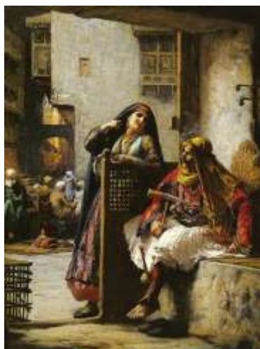
(Artist: Frederick Arthur Bridgman Date: 1847- 1928)

Don't narrow the message given to you by the lord. Don't corrupt the message given to you by the lord. Don't create the division and schism. Don't refuse the baptism that is destined. Don't refuse to be coloured by the lord. Don't refuse to absorb the goodness of the lord. Remember you shall reclaim your ordained truth! O mortal!