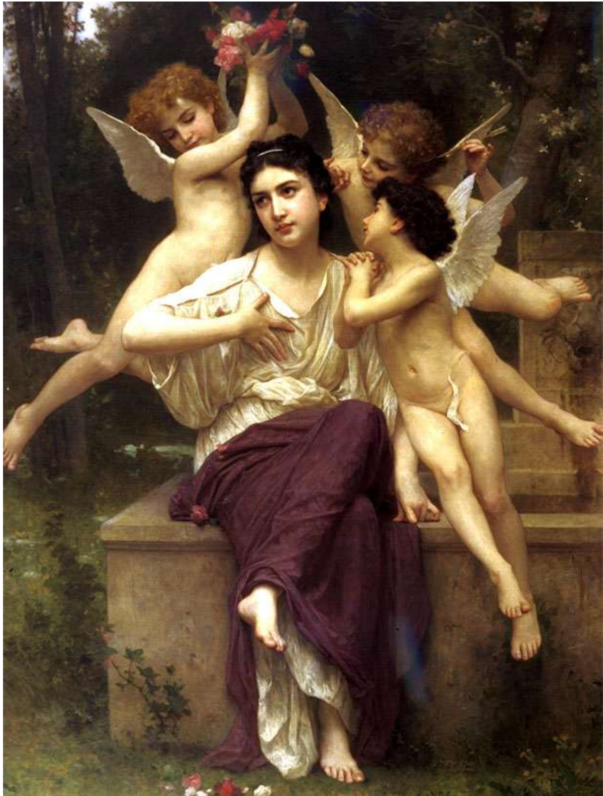
(Artist: William-Adolphe Bouguereau Date: 1892)