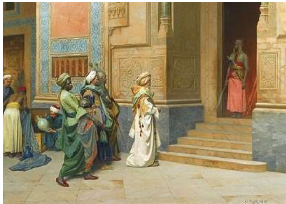
(Artist: Ludwig Deutsch Date: 1855-1935)

Listen! O people of faith! You shall be guided to the way that is straight. You shall be turned to grace. You shall not sway to and fro. You shall be firm in god's way. You shall not entangle your tongue. You shall not engage in the useless debate. Forget not! That you shall be made the witness! O mortal!