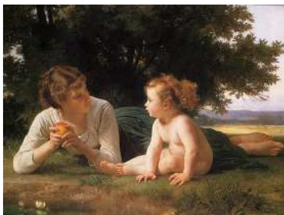
(Artist: William-Adolphe Bouguereau Date: 1825-1905)

Recall The Special Favour I Bestowed To You! O Mortal!