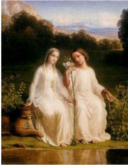
(Artist: Anne Francois Louis Janmot Date: 1814-92)

Listen! O people of faith! Say not the words of ambiguous import. Utter not but the words of respect. Let not cynicism sink into your heart and soul. Utter not the words that have hidden barb in them. Utter not but the plain and honest words. Let not vanity consume your words. Remember, the dominions of heavens and the earth belong to you! O mortal!