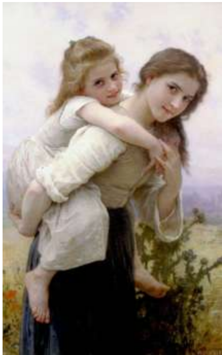
(Artist: William-Adolphe Bouguereau Date: 1825-1905)

You shall understand the primal conception. Forms and matters shall perish sooner or later. Remember the heavenly signs shall be shown to you! O mortal!